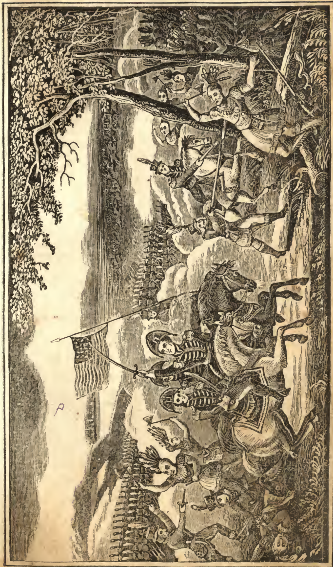
BATTLE OF THE THAMES, AND DEATH OF TECUMSEH ..... GENERAL HARRISON.